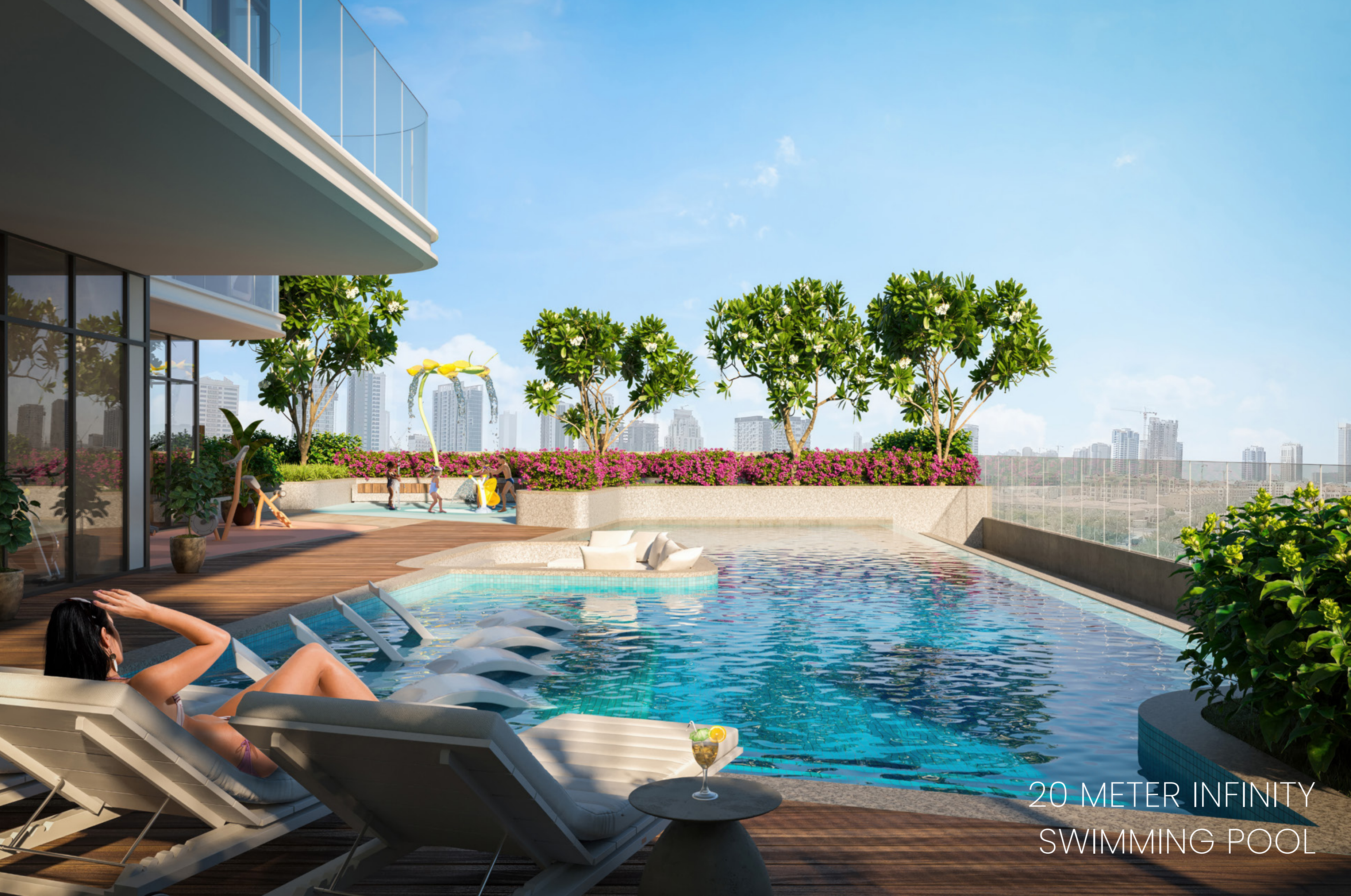
20 METER INFINITY SWIMMING POOL